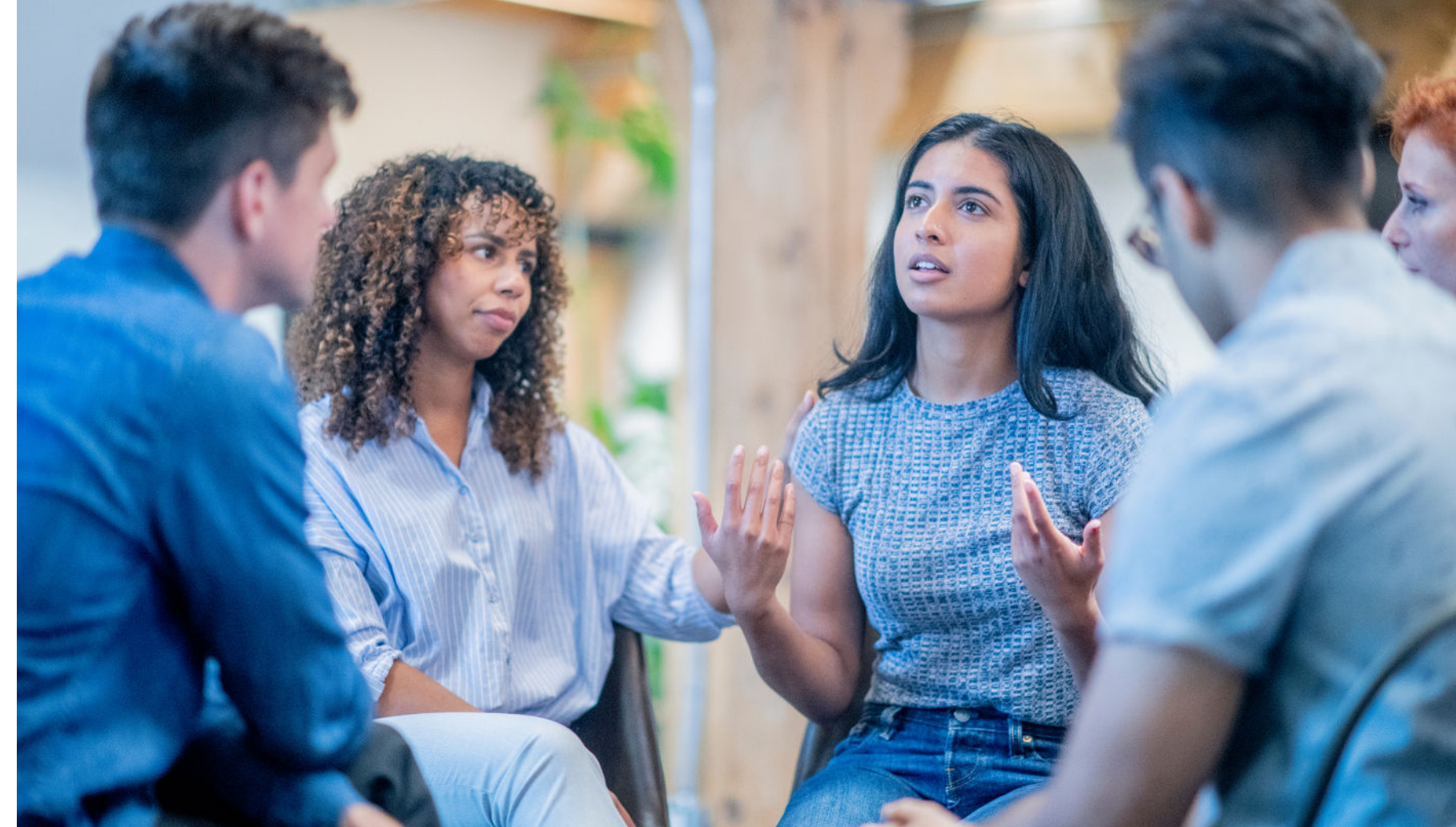
BUILDING BLOCK #7

WHAT AMOUNT OF TIME IS DEDICATED TO TRAINING SUMMER STAFF AND VOLUNTEERS?