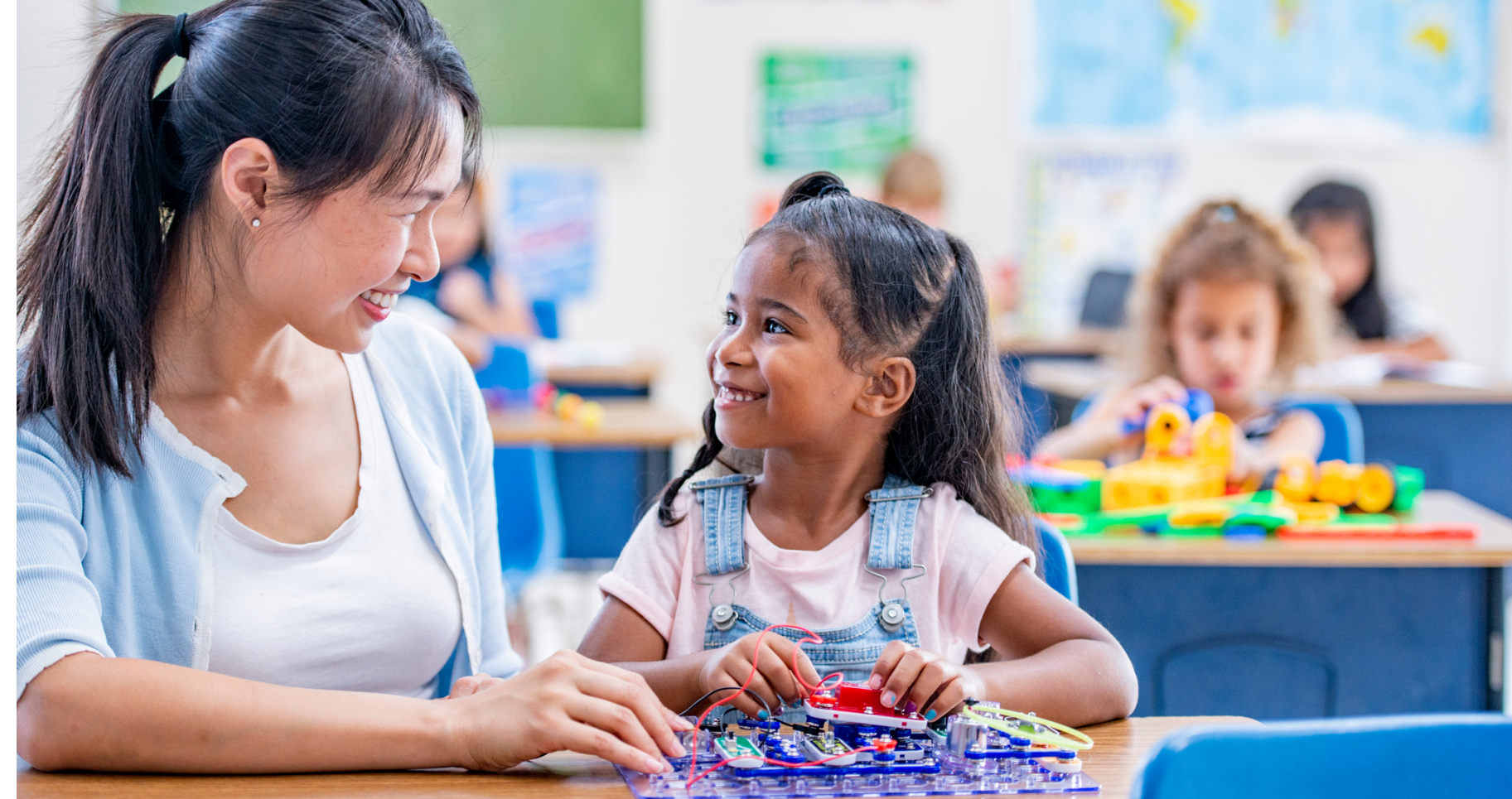
BUILDING BLOCK #3

WHAT DOES AUTHENTIC YOUTH VOICE AND CHOICE LOOK LIKE?