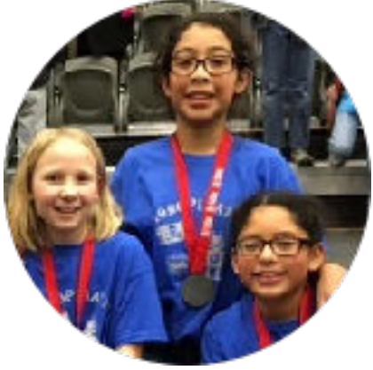
All-girl FLL robotics team from Notus, funded by F3 Idaho Project, coordinated by ION