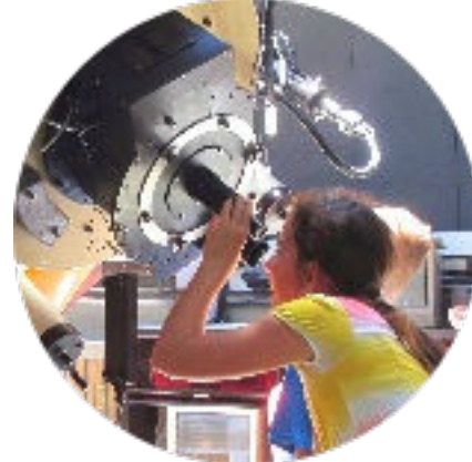
Student at CSI planetarium during 2017 Zero Robotics Program, coordinated by ION