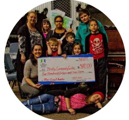
Mini-grant recipient, Bridge Community Center, received funds for musical instruments