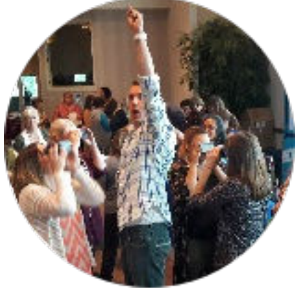
Breakout session at the statewide 2017 Power Up! Summit, hosted annually by ION