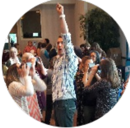
Breakout session at the statewide 2017 Power Up! Summit, hosted annually by ION