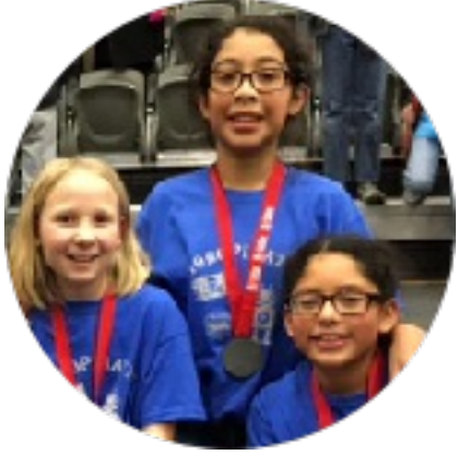
All-girl FLL robotics team from Notus, funded by F3 Idaho Project, coordinated by ION