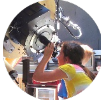
Student at CSI planetarium during 2017 Zero Robotics Program, coordinated by ION