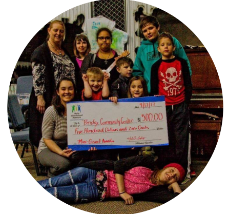
Mini-grant recipient, Bridge Community Center, received funds for musical instruments