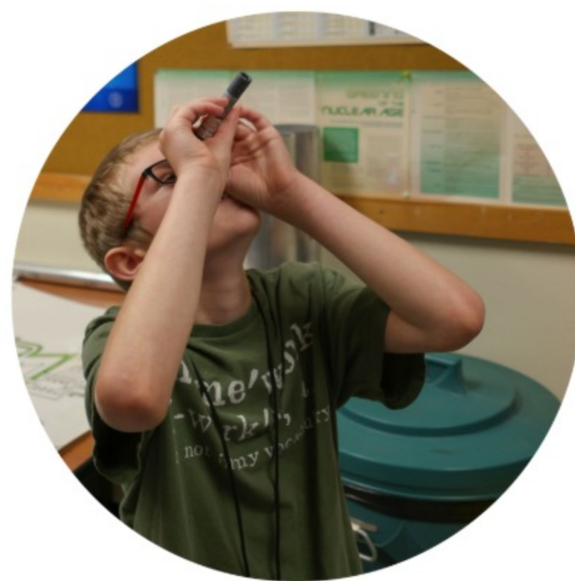
Zero Robotics Field Day at Idaho Museum of Natural History