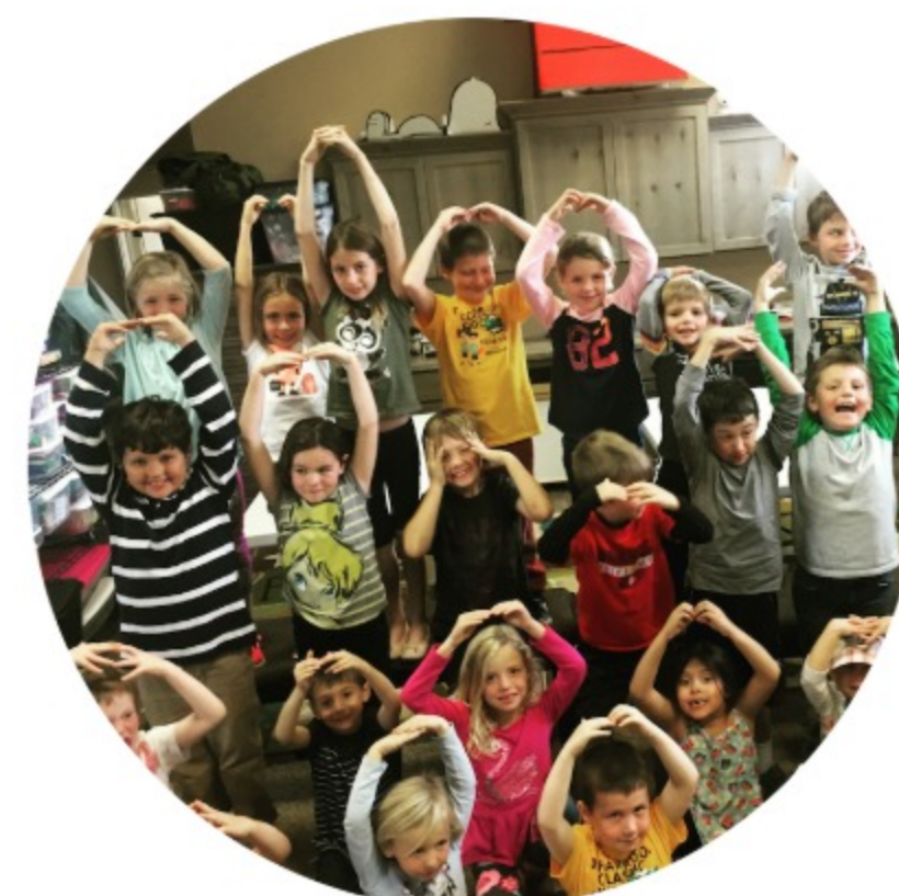
Lights On Afterschool at Hidden Springs Library