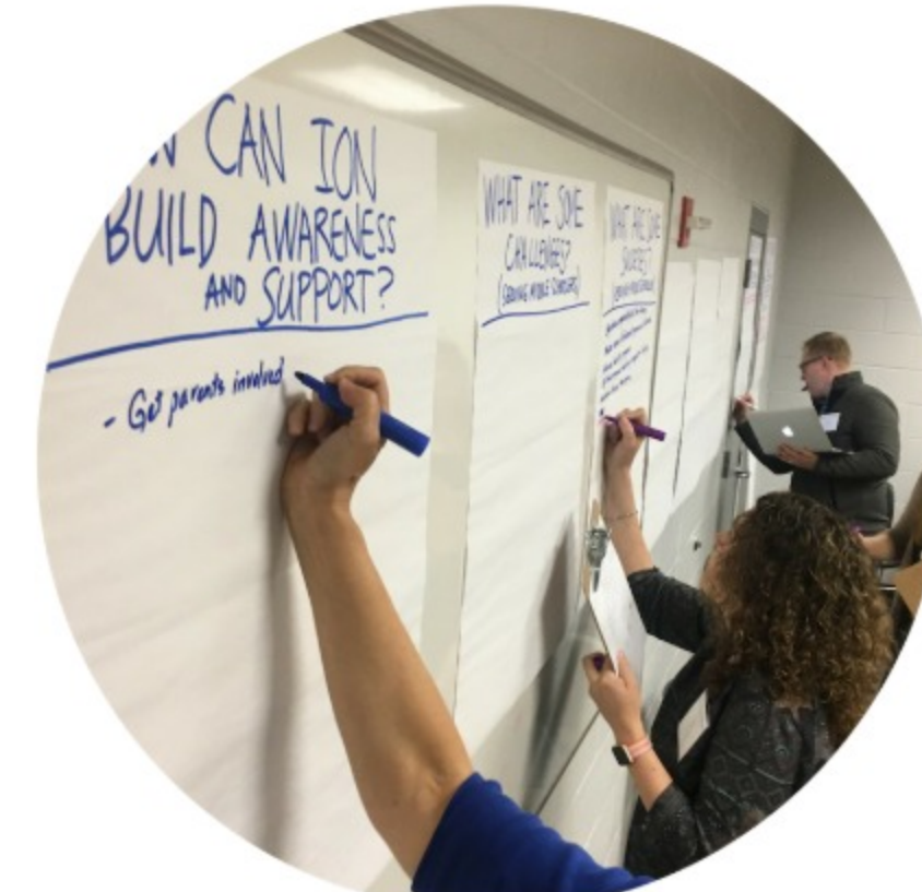
Providing Input at the Caldwell Regional Roundtable