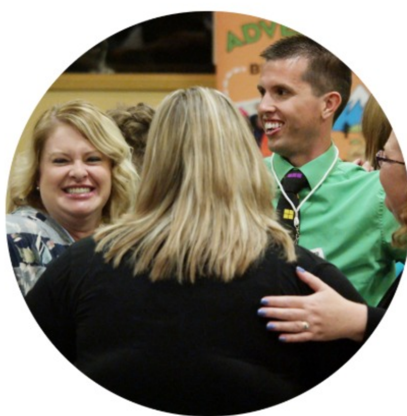
Group Activity at 2018 Power Up! Summit